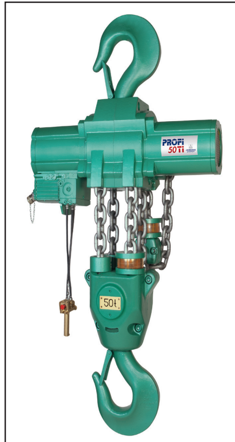
50 TI Air Chain Hoist pictured