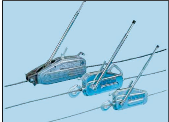
Powerful: Griphoist-Tirfor® TU machines are in daily operation on construction sites around the world putting power where it is needed for lifting, pulling and handling a wide variety of loads.